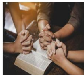
Gathered In Prayer

Drop in any Thursday morning at 10 a.m. in the Chapel, to pray for your fellow parishioners.